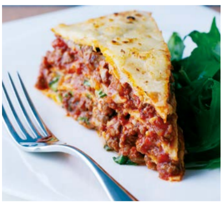
Weekend Family Meal