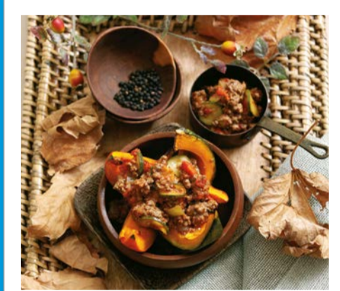
Indicate a season or time of year