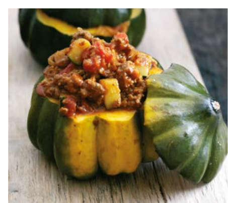
Natural wood or stone provides a rustic style