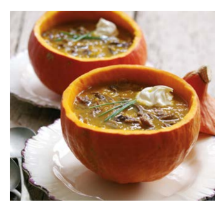
Swirl, pipe or brush crème fraîche, jus or purée