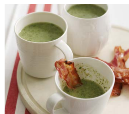
Alternative plates - serve soup in coffee cups or pâté in a preserving jar