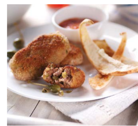
Add crispy croutons for texture