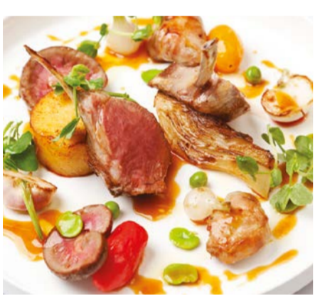
Dinner party with friends