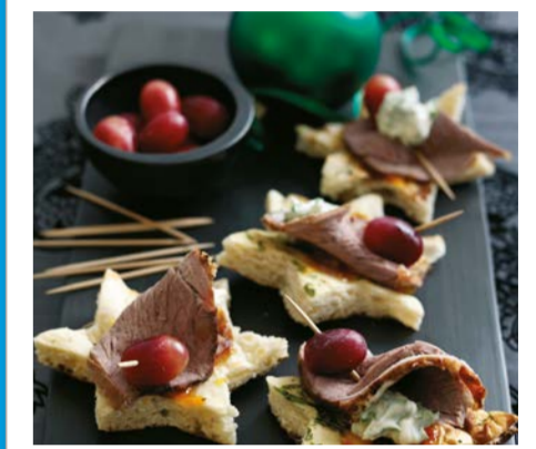
Highlight a theme or celebration