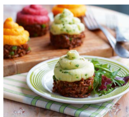
Liven up your plate with vegetables or sauces in bright sharp colours