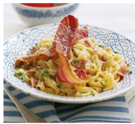
Consider portion size and current healthy eating advice