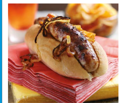
Demonstrate a meal occasion