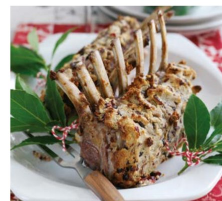
Sprinkle fresh herbs or ground spices