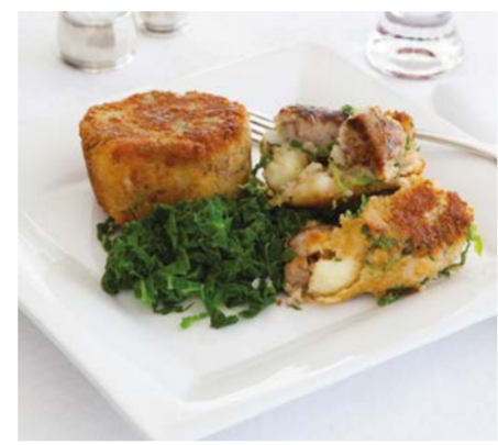
Plain white china - remember to wipe the plate clean