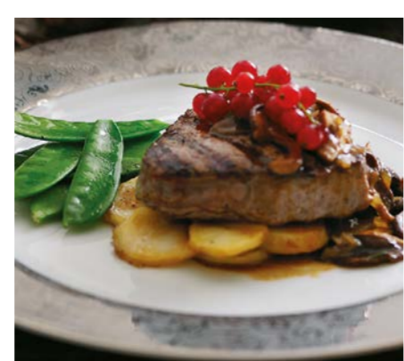
Patterns should be on the border of plates so as not to distract from the food