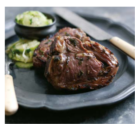
Dark coloured china - black crockery can be very dramatic and elegant