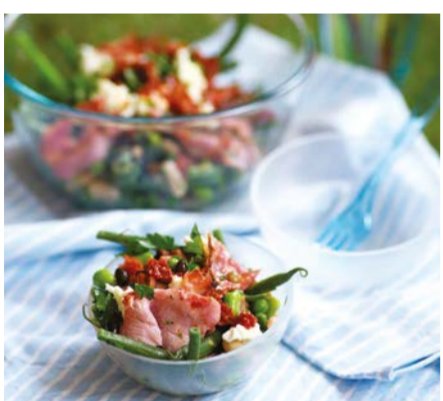
Speedy weekend lunch for one