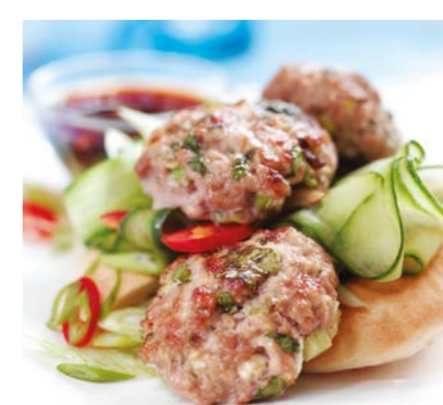
Twirl ribbons of vegetables