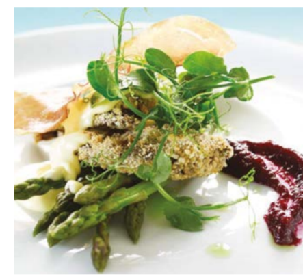
Arrange edible flowers or pea shoots