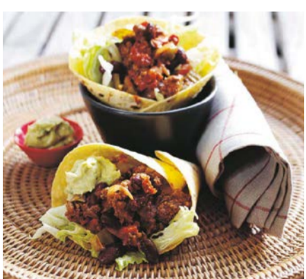
Movie night for teenagers