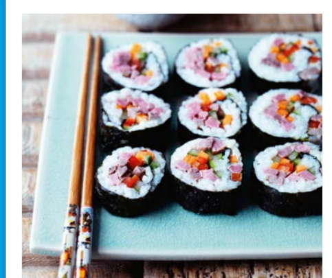
Showcase features and characteristics of a cuisine