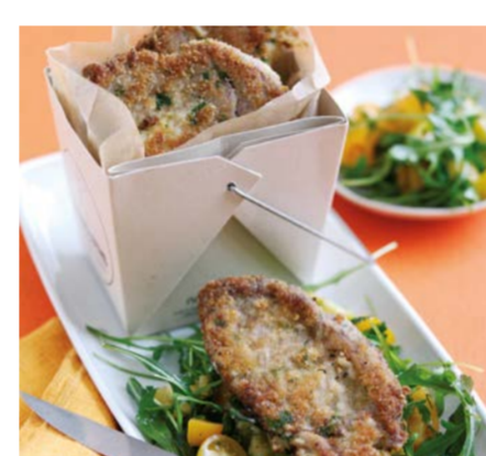
Present in odd numbers for visual appeal