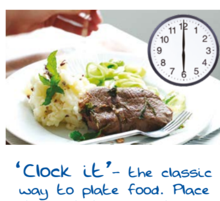
'Clock it' - the classic way to plate food. Place the potatoes, pasta or rice at ten o'clock, meat or fish at six o'clock and the vegetables at two o'clock