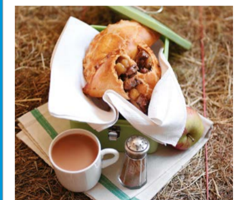
Help evoke memories